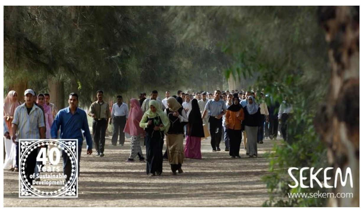
SEKEMSophia Symposium - The Miracle in The Desert