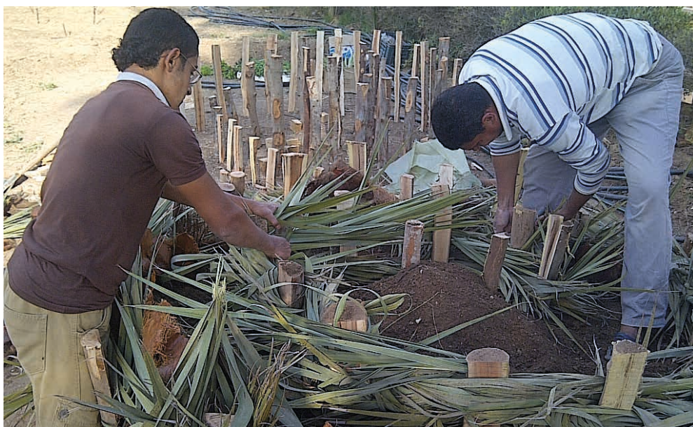
Team members create a herb garden in the form of a spiral as part of the new SEKEM school garden.

In an ambitious project, the school garden of the SEKEM School undergoes a professional redesign. In addition to biodynamic farming, permaculture is also to be used when the project is completed.