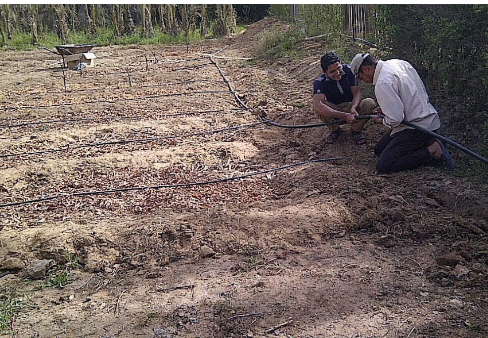
The team experimented with different irrigation systems that reduce water consumption.

most obvious cause also at the SEKEM School is to inspire children to experience agriculture themselves, to guide them and to help them to deepen their practical and theoretical knowledge about how agriculture is conducted and what it means to the production of our food. To assist in the design, the construction of and the care for the garden and trains the five senses of especially the youngest pupils as they experience new colours, smells, and tastes and receive the opportunity to touch and maybe even plant guava, chamomile and many other species. In doing this, they experience literally “first hand” where their food comes from. The SEKEM School’s pupils of the third grade, for example, plant their own wheat, provide for irrigation, harvest by hand and produce from it their own bread – which is then of course eaten at school. This encourages everyone involved to develop a deep respect for the foods that they consume on a daily basis.